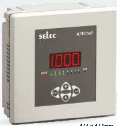
144 x 144mm